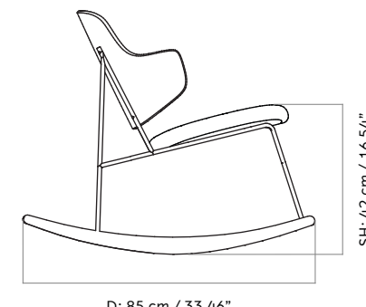
D: 85 cm / 33,46"

MENU - PRODUCT SHEET MENU — PRODUCT SHEET